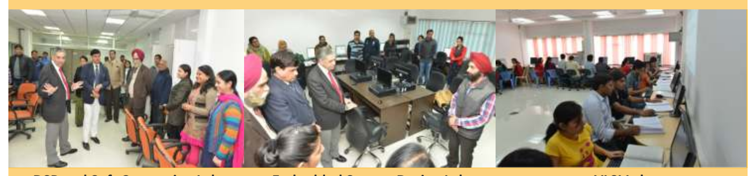
DSP and Soft Computing Lab